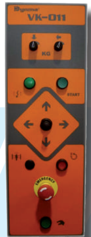
Simplified control panel for "ECO" version.

Copyright 2011. Desarrollo Industrial de Maquinaria Benicarló S.L. The information contained in this document is subjected to change and it is not binding.