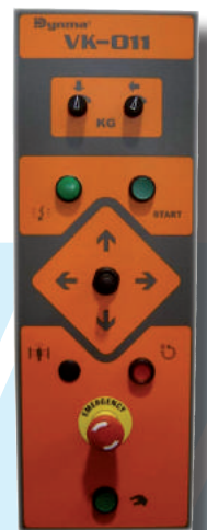
Simplified control panel for "ECO" version.

Copyright 2011. Desarrollo Industrial de Maquinaria Benicarló S.L. The information contained in this document is subjected to change and it is not binding.