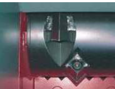
Flat rotor (GAZ 62 E)