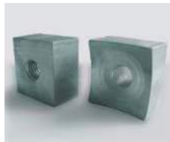
Square knife and concave ground knife