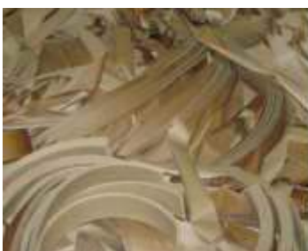
Waste from furniture manufacturing