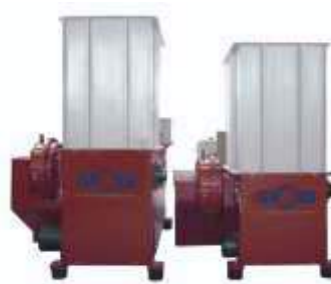
GAZ 62 S GAZ 62

The robust GAZ 62 series valuable substance shredders shred materials such as wood, cardboard, plastic and many others economically and effectively. The shredders can be adjusted according to customer specific requirements for throughput volume, material to be processed, etc. The GAZ 62 series shredders are compact and designed for high performance.