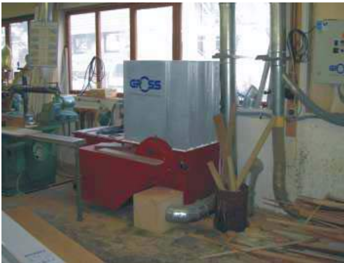
GAZ 62 used at a joiner's woodshop