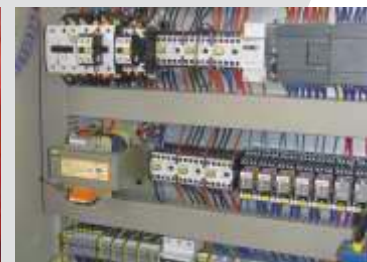
Switching cabinet / SPS control