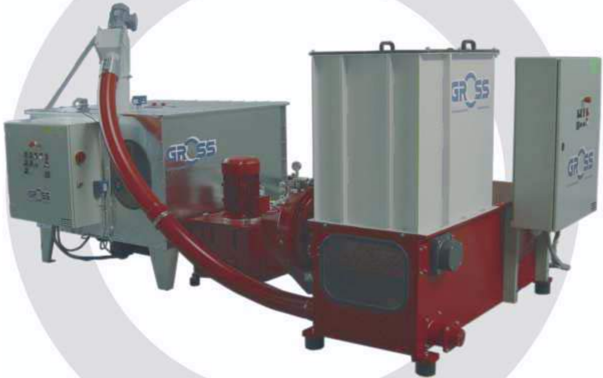
GAZ 62 with briquetting press GP