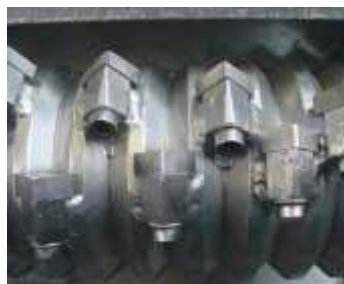
Profile rotor with welded knife carriers (GAZ 62 S)