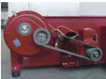
Transmission and motor

Material is fed through the hopper in front of a hydraulically operated drawer, which pushes the material load-controlled onto the turning rotor. The material is shredded between the rotor knives and a fixed counterknife. The drawer has strip-ping bars that prevent material from entering between the drawer and machine housing. The screen hole with different perforation diameters determines the size of clippings or shavings. Produced shavings can be removed from the machine with the suction device or spiral conveyor. Once the material is shredded, the machine will automatically shut off.