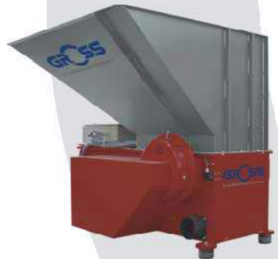
GAZ 62 with customer specific hopper