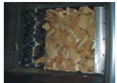
Hopper, filled with material